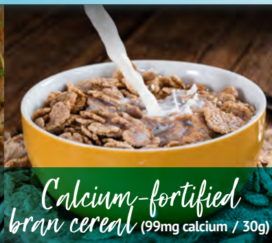
Calcium-fortified bran cereal (99mg calcium / 30g)