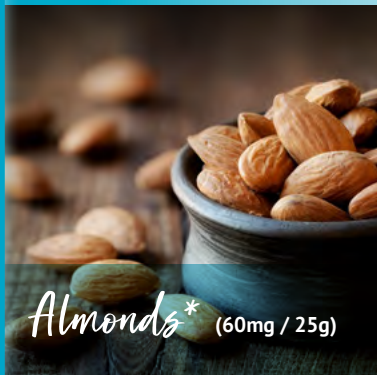
Almonds* (60mg / 25g)