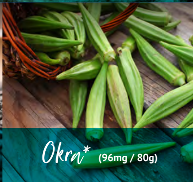
Okra* (96mg / 80g)