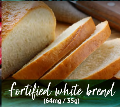
Fortified white bread (64mg / 35g)