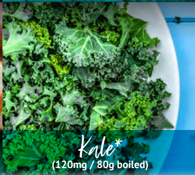
Kale* (120mg / 80g boiled)

A balanced and varied diet should provide enough calcium to meet our requirements. If you take a calcium supplement, make sure your total intake doesn't exceed 1500mg/day as this may cause stomach pain and diarrhoea.