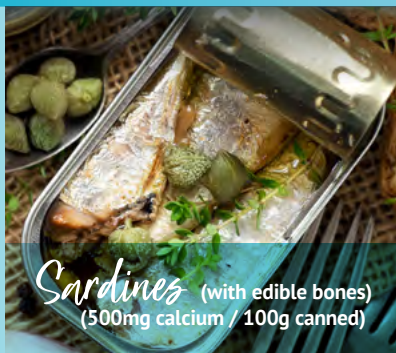
Sardines (with edible bones) (500mg calcium / 100g canned)