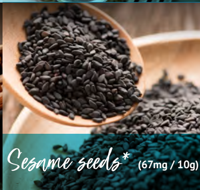
Sesame seeds* (67mg / 10g)