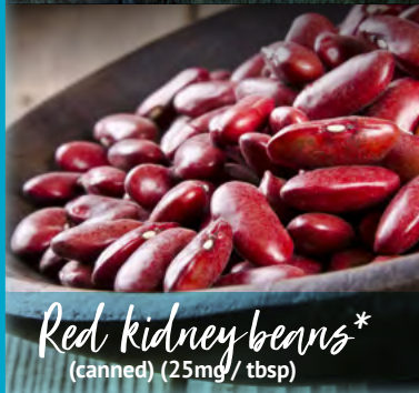
Red kidney beans* (canned) (25mg / tbsp)